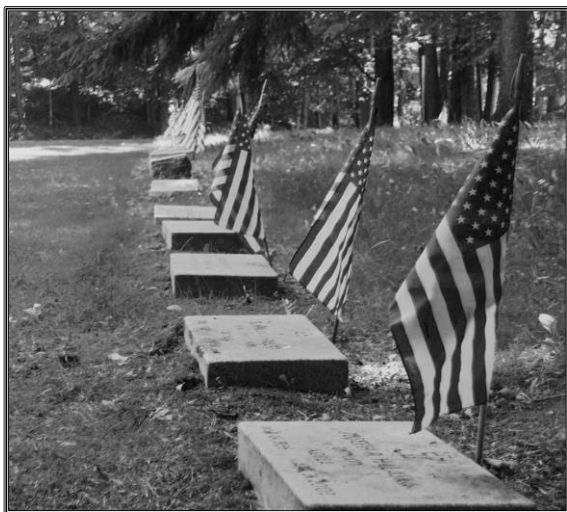
The Saturday before Memorial Day